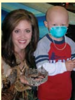
Jennifer Berry Miss America 2006

This new service requirement will not only continue the Miss America Organization's legacy of service and scholarship assistance, but also raise funds and awareness for Children's Miracle Network.